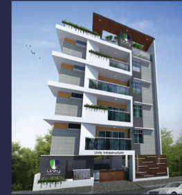
Ongoing Project at Jayanagar 5th Block

Company registered under companies act, 1956 and in the field of construction for the past 4 years. The company is incorporated with the main objects of Property Development, Construction of Apartments, Commercial Complexes & Residential Layout Project in response to the growing need for quality housing in Bangalore, Hubli, Dharwad & Belgaum.