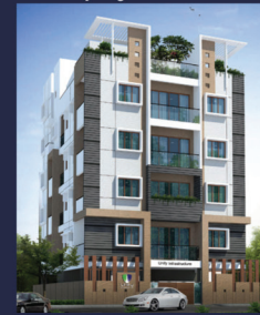
Proposed Project at Banashankari Unity Signet Block C