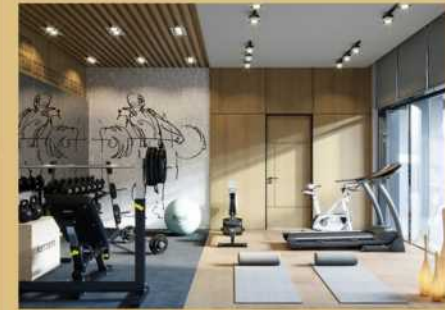
Well equipped Gym

Split A/C provision in master bedroom BESCOM power supply: 3KW 1PHASE supply Exhaust fans in kitchen and toilets Televisions points in living & master bedroom Telephone points in all bedroom, living & family room Intercom facility from security cabin to each apartment