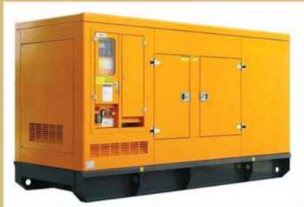
100% power backup